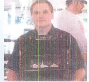
Robert H. Glass Auctioneers

Bake Sale Craft Sale Food Booth 9:00am on Beautiful Sturbridge Town Common